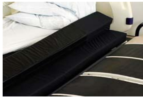
Hinged transfer pad allows full bed coverage and fits narrow stretchers.

The solution to your lateral transfer challenges